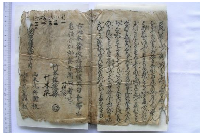
Original script "Kurobe book"

In the current production of Sonezaki shinju presented at the Ningyo Joruri Bunrakuza, parts of the original work have been omitted due to issues with staging. In order to achieve a production that is faithful to the original script, the "Kannon meguri" (Kannon Pilgrimage) overture has been reintroduced in this performance. The premiere production of 1703 will be recreated in the present, in 2011.