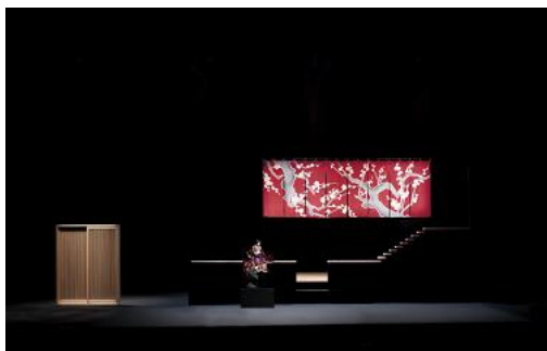
Tenmaya no dan

On April 7, 1703 (Genroku 16), Tokubei, a clerk to the soy sauce merchant Hirano-ya, and his lover Ohatsu, a courtesan from Dojima Shinchi, committed suicide together in the forest of Tenjin at the cape of Sone in Umeda. A month later, on May 7, 1703, this actual event was turned into a play by Chikamatsu Monzaemon entitled Sonezaki shinju tsuketari Kannon meguri , which premiered at the Takemotoza theatre in Osaka. The play was so successful that Takemotoza was able to repay all the debts it had at the time. Furthermore, Sonezaki shinju was the forerunner of the sewamono genre, which dramatized current events.