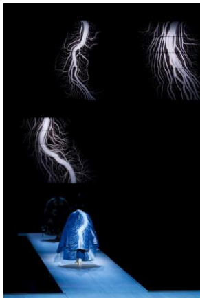
Sanbaso 《 Kami Hisomi Iki 》 2011 © Odawara Art Foundation

The Odawara Art Foundation reexamines traditional Japanese arts from a new perspective and plans, produces, and puts on productions of classical to contemporary theater. The foundation also is involved in the preservation and exhibition of the Sugimoto collection. Through these activities, the foundation hopes to pass on Japanese culture to the next generation in a wider perspective. As a base for its activities, is being built a cultural and artistic center equipped with facilities such as stages, exhibition halls, and tea ceremony rooms in Enoura in the city of Odawara.